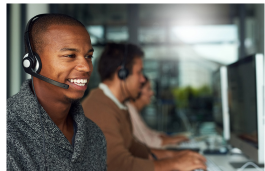
Our knowledgeable and talented support team delivers unparalleled support to our customers.

Boasting industry leading best wait-times and a knowledgeable support staff, RS2 strives to deliver the best support in the industry. In addition to phone and web support, we also use the web-based TeamViewer system to assist customers with rapid diagnosis and resolution of support issues. TeamViewer allows us to instantly share and interact with remote customer desktops – anywhere in the world.