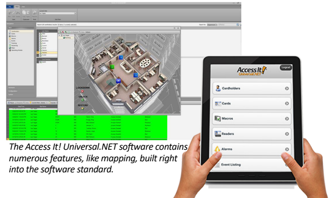
The Access It! Universal.NET software contains numerous features, like mapping, built right into the software standard.

RS2 Technologies offers the industry's most advanced and easy-to-use access control software in the industry. Whether working with Access It! Lite.NET, an entry-level access control software, the Access It! NEXT Step network appliance, a plug and play network appliance device that simplifies access control deployment, or Access It! Universal.NET, a system built to handle anything from a single door to a worldwide enterprise, RS2 Technologies has a solution to meet your needs. A simple and logical UI make learning and using the software painless while still delivering security and stability.