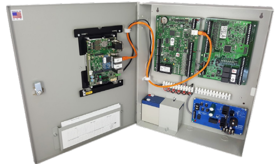
The Access! NEXT Step features a pre-configured PC that simply needs to be plugged in and assigned an IP address to deploy

RS2 Technologies also works with the industry leaders in biometrics, DVR/NVR systems, IP/Wireless locksets, readers & credentials, and enclosures to deliver a complete and total access control solution. RS2 Technologies has been recognized as a Platinum Elite Mercury partner signifying RS2 Technologies is a premiere partner.