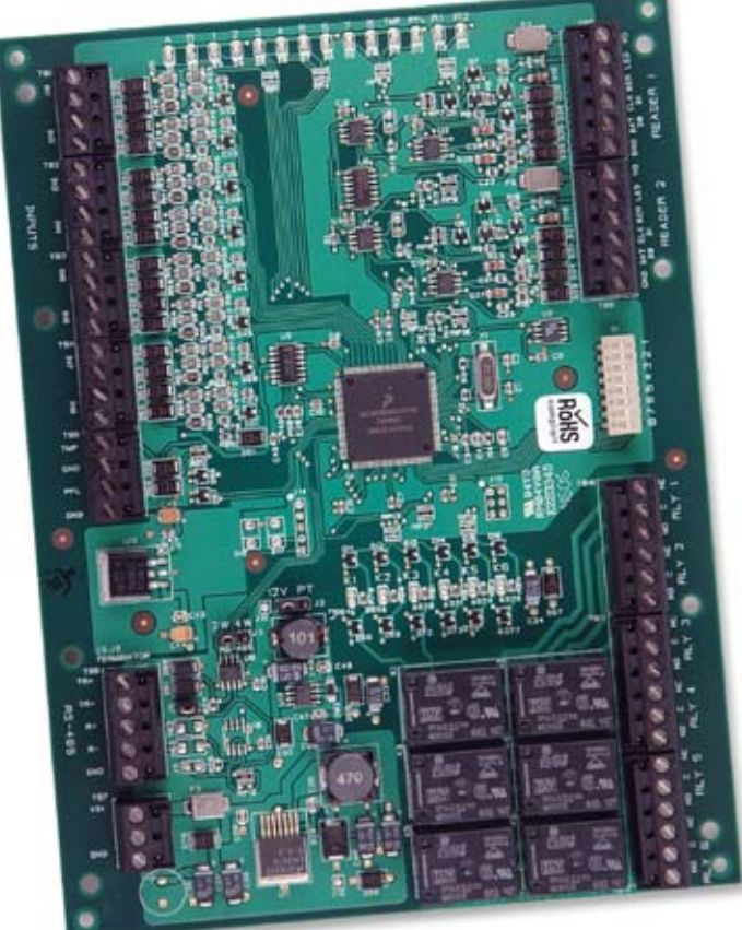
The MR-52 is a cost-effective, highperformance dual reader I/O module.